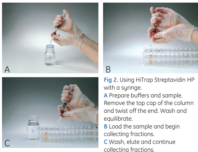
Fig 2. Using HiTrap Streptavidin HP with a syringe.

The interaction between streptavidin and biotin is very strong and requires denaturing conditions for elution. This strong interaction can be utilized in the purification of antigens. Biotinylated antibody-antigen complexes bind to the HiTrap Streptavidin HP column, enabling subsequent elution of the antigen. An alternative application is to exploit the interaction between 2-iminobiotin and streptavidin, which is a weaker interaction. Iminobiotinylated substances can be eluted from the column at pH 4, as shown in Figures 4a and 4b.