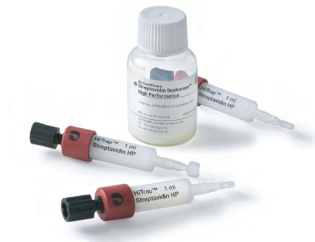
Fig 1. HiTrap Streptavidin HP and Streptavidin Sepharose High Performance.

The medium is supplied in prepacked 1 ml HiTrap columns or as 5 ml medium in suspension stored in 20% ethanol. Medium in suspension is easily packed into for example Tricorn™ 5/50 columns (see Ordering information for details).