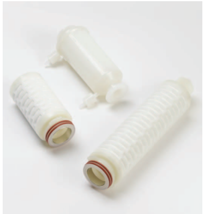
Figure 1. ULTA Prime GF cartridges and capsule.